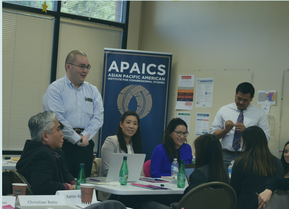
2020 Regional Leadership Academy in Las Vegas, Nevada